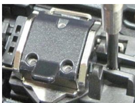
How to set

Note: CLAMP-S70 series is supplied as a pair, for the left and the right respectively.